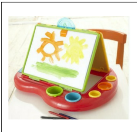
Table Top Art Centre